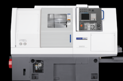
1X CITIZEN MIYANO BND-51SY2