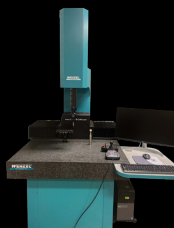
1X WENZEL SMART 500 SCMM