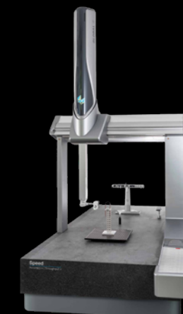
1X HEXAGON GLOBAL S.E./P