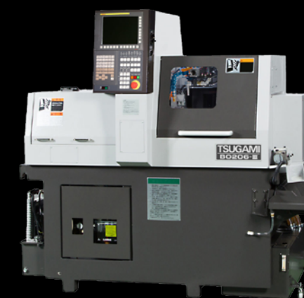
1X TSUGAMI B206