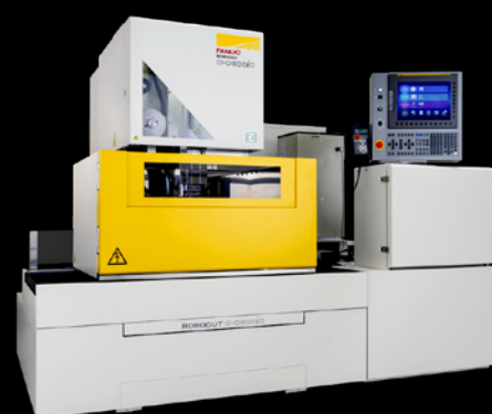
1X FANUC ROBODUT 01E