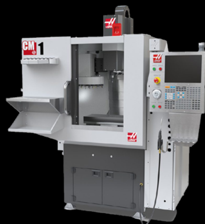
1X HAAS CM1

Our commitment to excellence is also reflected in our legacy equipment, which continues to deliver exceptional precision. Prior to the recent expansion, our fleet included the following machines: