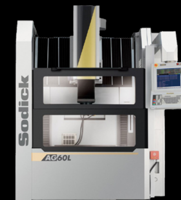
1X SODICK AG60L