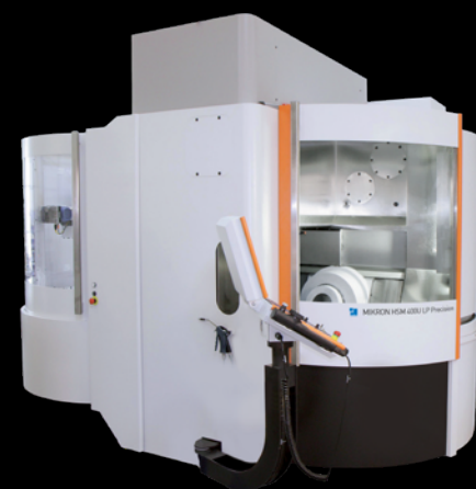
1X MIKRON HSM 400U LP

5-AXIS WITH 18-PALLET SYSTEM, 42,000 RPM