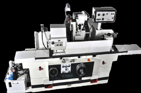
1X MICROMATIC GRINDING CGU 350