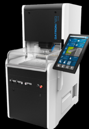
1X DATRON NEO