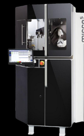
1X CHIRON MICRO 5