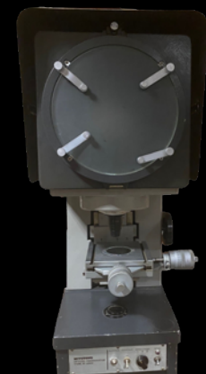
1X MITUTOYO PJ250 PROFILE PROJECTOR