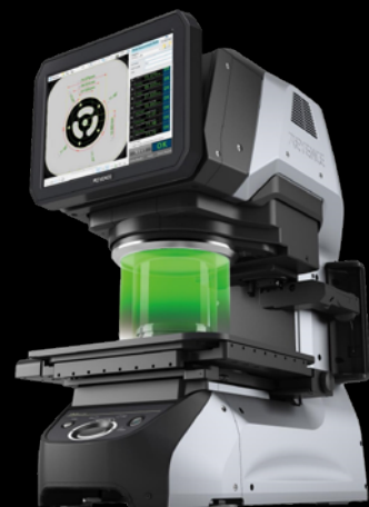
1X KEYENCE IM-7000 IMAGING PROJECTOR