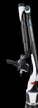
1X HEXAGON 7525 SI

7-AXIS MEASURING ARM WITH INTEGRATED SCANNER