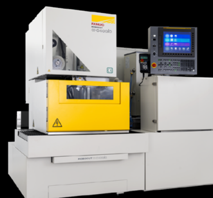
1X FANUC ROBODUT 01D