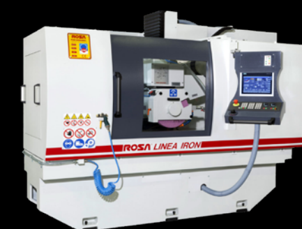
1X ROSA LINEA IRON N11.6N