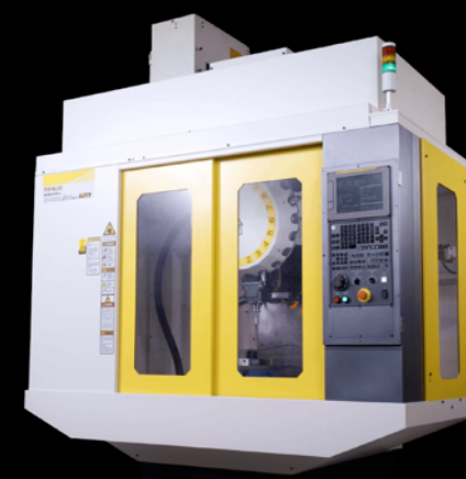
1X FANUC ROBODRILL T21IEL

WITH EASYBOX T30 ROBOT, EQUIPPED WITH 60 PALLETS