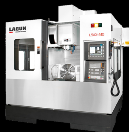
1X LAGUN 5 AXIS L5AX-410

WITH EASYBOX L250 ROBOT (104 PALLETS), 1X 24000 RPM, 1X 18000 RPM