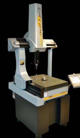
1X TESA MICRO-HITE 3D