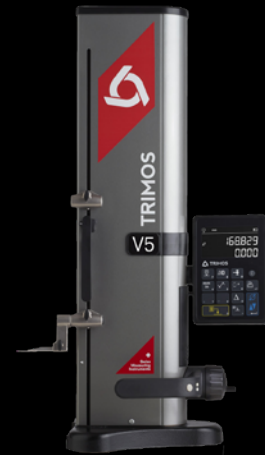
1X TRIMOS V5 HEIGHT GAUGES (X4)