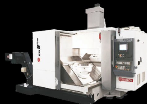
2X HURON K3X8 FIVE 5 AXIS

5-AXIS WITH 18-PALLET SYSTEM, 42,000 RPM