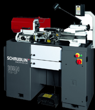
1X SCHAUBLIN 102